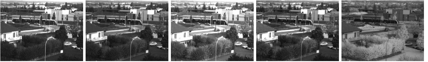
Fig. 2. Five spectral bands extracted from a multispectral image.

negatives, i.e. both a high precision and recall value. The F-measure combines precision and recall and make the analysis of results easier.