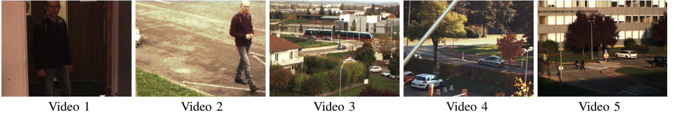
Fig. 1. Snapshots of each camera viewpoint of the video dataset.

For each scene, we have acquired a sequence of multispectral images whose framerate depends on the overall scene illumination, i.e. from 5 frames per second for dark scenes ( e.g. video 1) to 15 frames per second for bright ones ( e.g. video 3). The acquisitions are performed with a commercial camera from FluxData, Inc. (the FD-1665-MS). This camera is based on a 3-CCD system that provides simultaneous data for each spectral band. It can acquire 7 spectral narrow bands, six in the visible spectrum and one in the near infrared. An example of a multispectral image is presented in Fig. 2. This camera is light and compact and is adapted for videosurveillance applications.